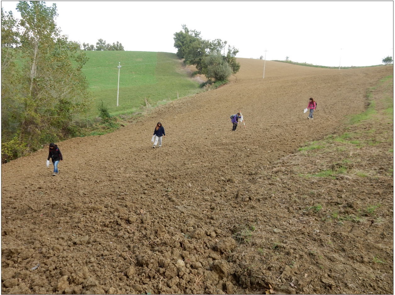
Fig. 2. Comune di Amandola (Fermo): survey in progress.

and quantitative evidence should be integrated with qualitative and symbolic data in order to reconstruct all the anthropic activities throughout the centuries (see Pasquinucci & Menchelli, 2012b). We try to follow a third way, adopting an eclectic and flexible approach, enabling us to avoid the excesses of both processual positivism and of post-processual subjectivism (Bintliff & Pearce, 2011). Therefore we attempt to outline both landscapes and mindscapes (e.g. see Ashmore & Knapp, 1999 for conceptualised and ideational landscapes).