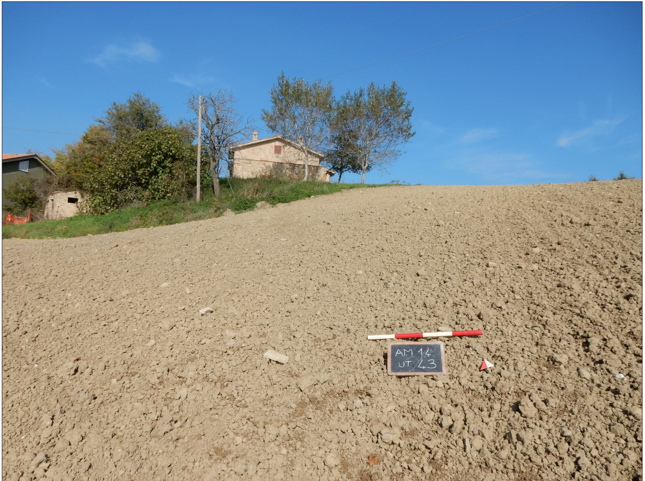
Fig. 3. Comune di Amandola (Fermo): an example of erosion process.

typology, technology, function and cognitive, social and economic matters: see the most recent work on this subject by Giannichedda (2014). Therefore, when we find an object we should not use it, reductively, simply in order to date the context, but we should also consider where and how it was produced, its function, the possible role it had in social relations, its significance for economic history, how was it transported from the production site to the place where it was found.