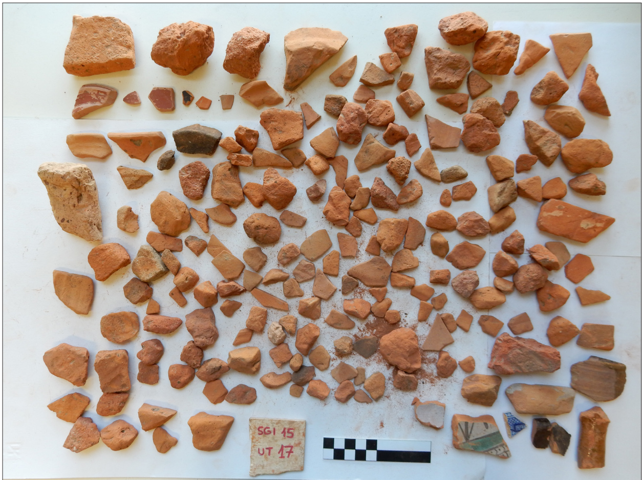
Fig. 5. Comune di San Giuliano (Pisa), Topographic Unit 17: finds considered evidence of a Roman farmstead.

walled pottery may be completely destroyed by the fragmentation processes and due to abrasion, moreover black-glazed and terra sigillata sherds often lose their slip and become unrecognizable,