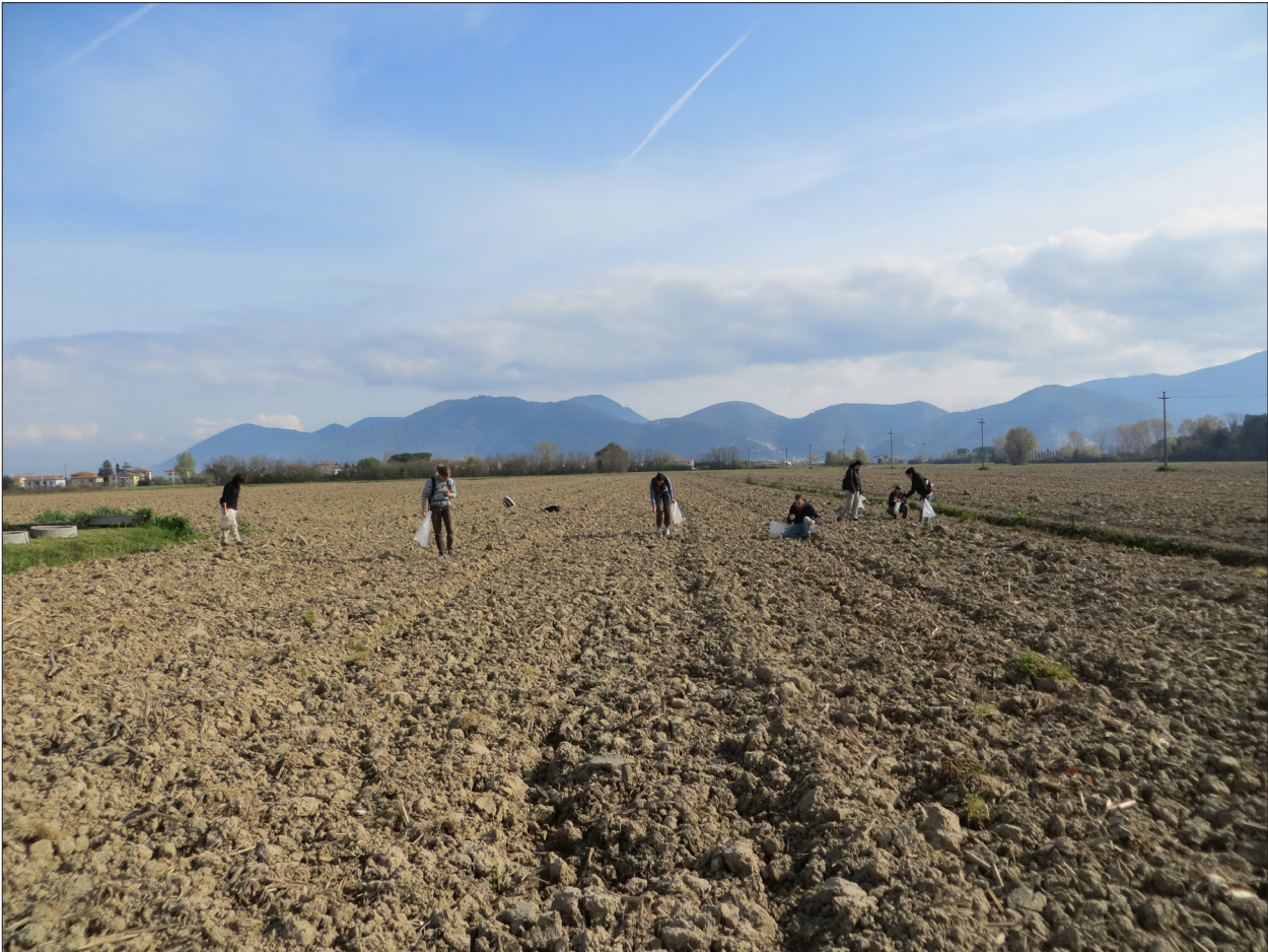
Fig. 1. Comune di San Giuliano (Pisa): survey in progress.

In these projects data is organised and managed by GIS platforms (e.g. see Iacopini et al, 2012). During the survey, the site and offsite locations are georeferenced and recorded through a mobile system which collects and sends geo-tagged photos and the site/offsite descriptive data to a Web-GIS platform. This procedure permits an immediate recording of the raw data, providing more time for further research.